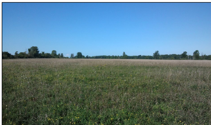
Extensive grassland habitat on Point Peninsula WMA

the season. Small game hunters can enjoy pursuing cottontail rabbits and Wild Turkey. The diversity of grassland, shrubland, wetland, and forest habitat create many funnels for big game hunters to pursue white-tailed deer on this WMA. There are four manmade impoundments that provide valuable stopover and breeding habitat for several waterfowl and marsh bird species including American Green-winged Teal, Blue-winged Teal, American Bittern, Pied-billed Grebe, and