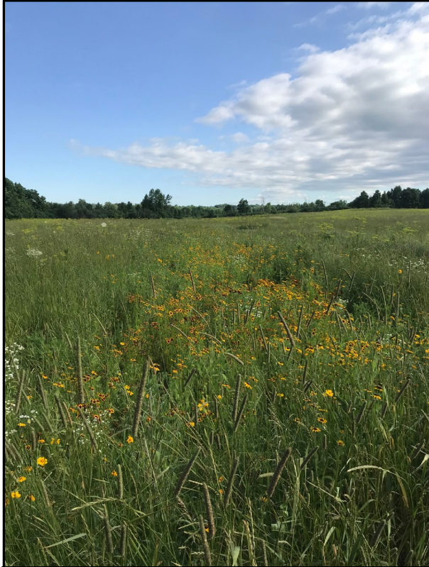
Grassland habitat on Point Peninsula WMA