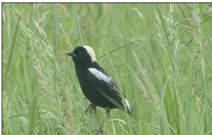
Bobolink enjoying the grassland at Point Peninsula WMA.

This property also provides access for viewing and/or photographing other types of wildlife including white-tailed deer, raccoon, and fox. Amphibians and reptiles that can be found on the WMA include green frogs, garter snakes, and painted turtles.