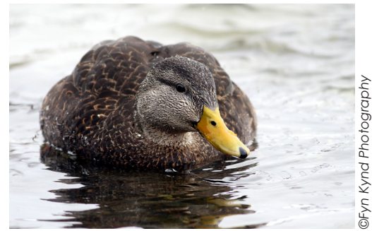
American black duck.

After more than 30 years of 1-bird daily bag limits for black ducks, duck hunters in the U.S. will have an opportunity for a 2-black duck daily bag limit in 2017. Why the change after all these years? Three developments led to this shift.