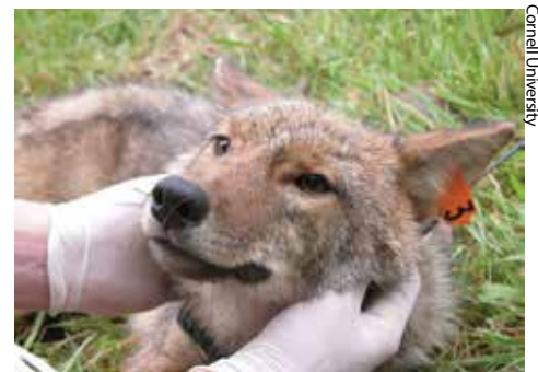
A Cornell graduate student examines a coyote.

These results are preliminary; researchers are finalizing their study of the impacts of coyote predation on adult white-tailed deer and fawn recruitment.