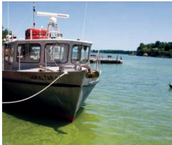
A cyanobacterial bloom in Lake Erie. It’s impossible to tell visually, by taste or odor whether such a bloom is toxic (a HAB). Water samples must be analyzed for the presence of toxins.

If you suspect your dog has been exposed to cyanobacterial toxins, seek immediate veterinary care. You can also contact various pet poison hotlines (listed in this brochure) for more information. Untreated, cyanobacterial poisonings are usually fatal in dogs. Even in cases where a poisoned dog receives prompt veterinary care, the outlook for a dog is often poor and the dog may not fully recover. Veterinary care can last a few days to several weeks.