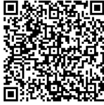
DWSP2 Interest Form

To learn more, fill out the DWSP2 Interest Form to schedule an information session.