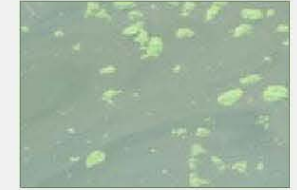
D. Green dots or clumps on/in the water