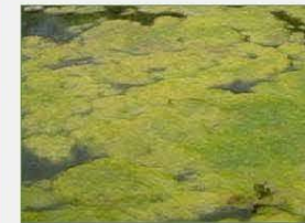
E. Bubbling scums on the lake surface