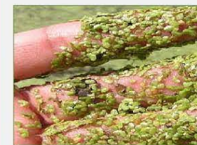
G. Duckweed or watermeal