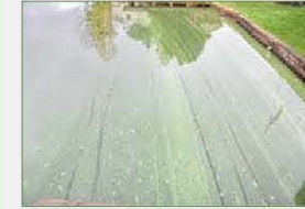
C. Streaks (usually green) on the water