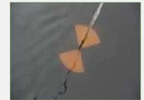
F. Slight greenish or brownish tint to the water