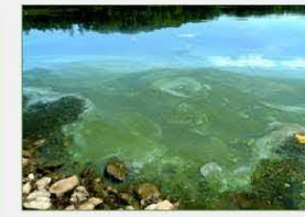
A. Spilled paint appearance on surface