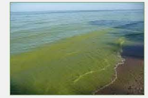
B. Pea soup appearance within the water