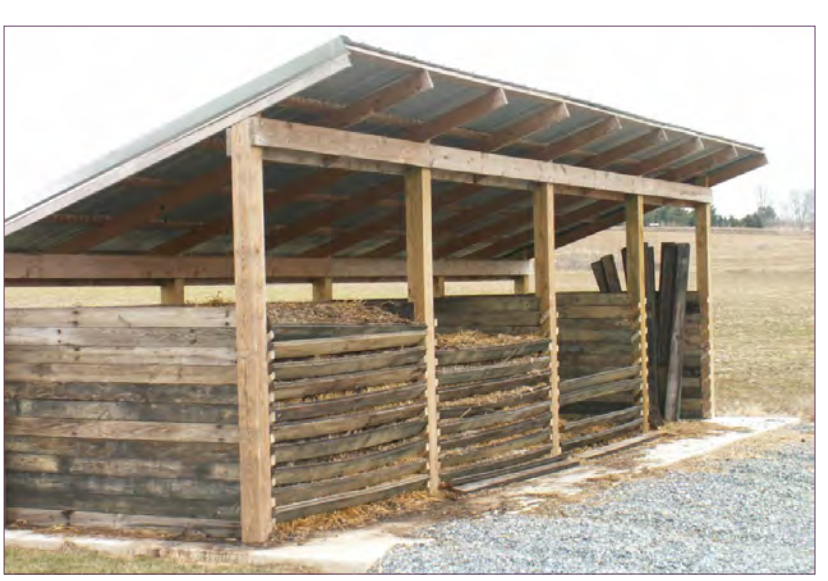
Figure 6-11. Example of a wooden bin used for poultry

Several common styles of mortality composting bins are available. The choice depends on factors that include the type of operation, animal species, regularity and