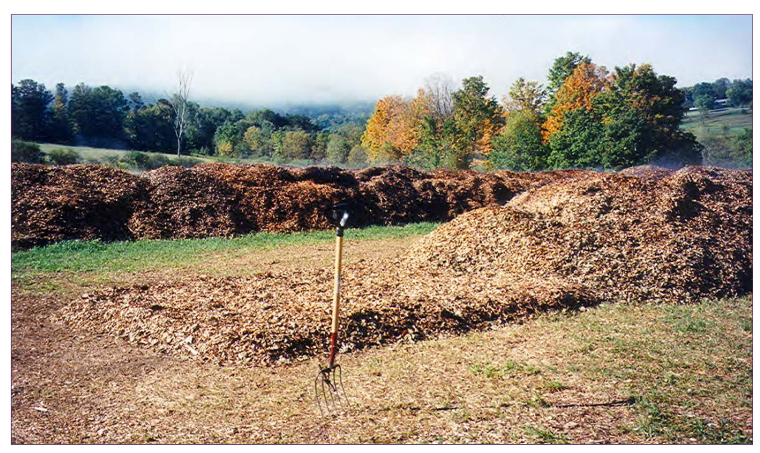
dated flags can be placed Figure 6-8. Static windrow composting with bed prepared for additional animals or butcher in the pile to keep track; waste

weekly in layers, it is best to stair step the animals into the pile. Build the first end and extend a carbon bed out so that it is ready for additional animals. In the case of large animals, there is no middle layer, so this will be the final cover layer or biofilter and should be 24 inches (61 cm). When animals are added to the pile, dates should be recorded, especially the last one. If it is a windrow. in the pile to keep track; one end of a 100 foot (30