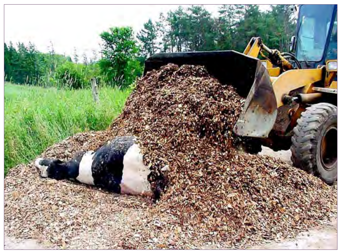
Figure 6-2. Enveloping a carcass with wood chips

Mortality composting methods evolved from the basic passively aerated pile or bin approach developed for composting poultry mortalities. With that approach, a number of carcasses are placed in a layer on a base of dry amendment and capped with more amendment. Lavers are built upward in succession until the pile or bin reaches its desired maximum height 6-4). (Figure Layering predominates with small