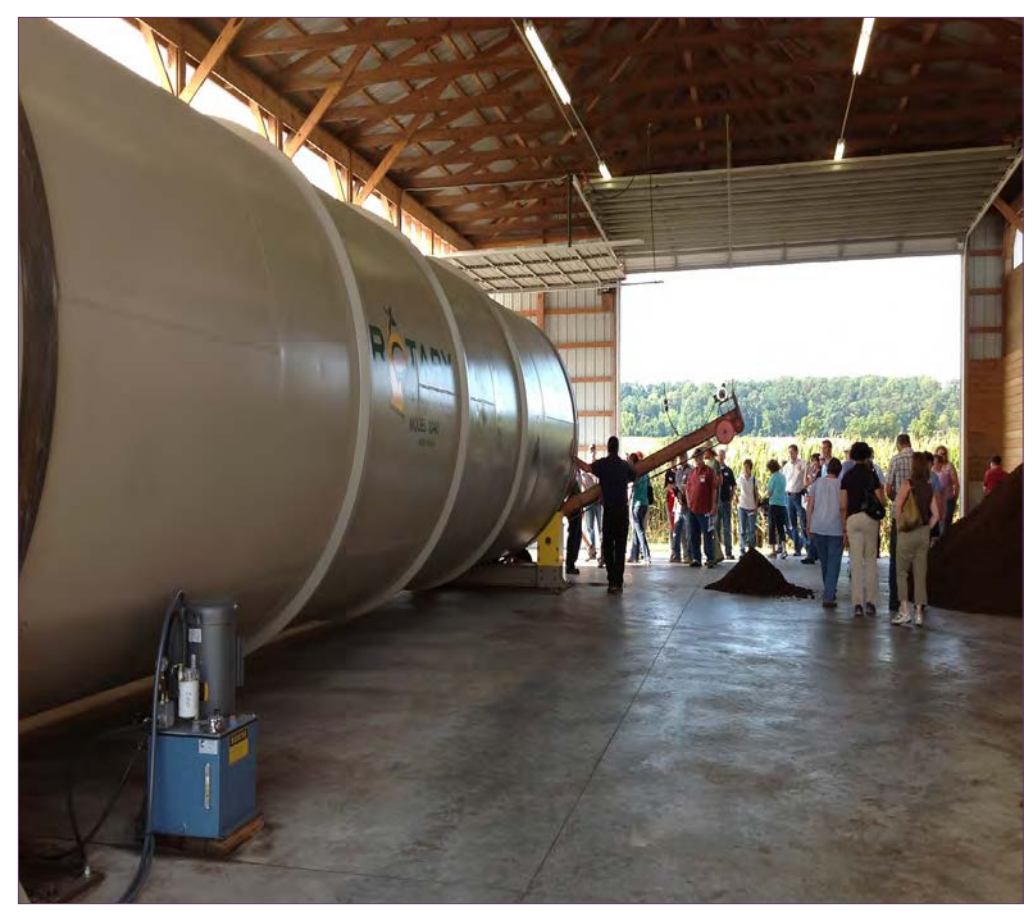
Figure 6-13. Rotating drum for carcass composting