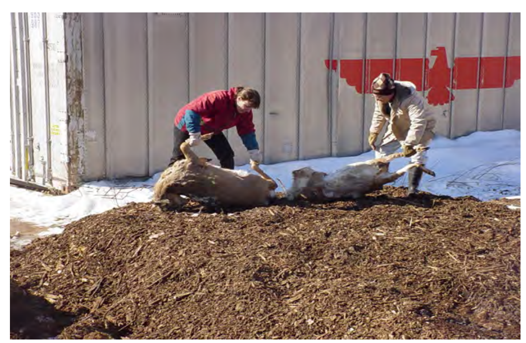
Figure 6-9. Deer carcasses placed on the base layer