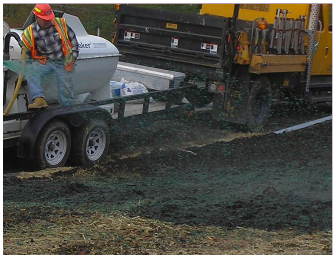
Figure 6-10. NYS Department of Transportation applying road kill compost along highway

compost undisturbed for roughly 2 weeks to 6 months, depending on the largest carcass size and management objectives. The pile/bin should be monitored for temperature, odors, and signs of scavengers, flies and leachate. Any problems that are detected should be corrected (Monitoring Compost Piles or Windrows). In the meantime, new piles or bins may be started to treat additional mortalities.