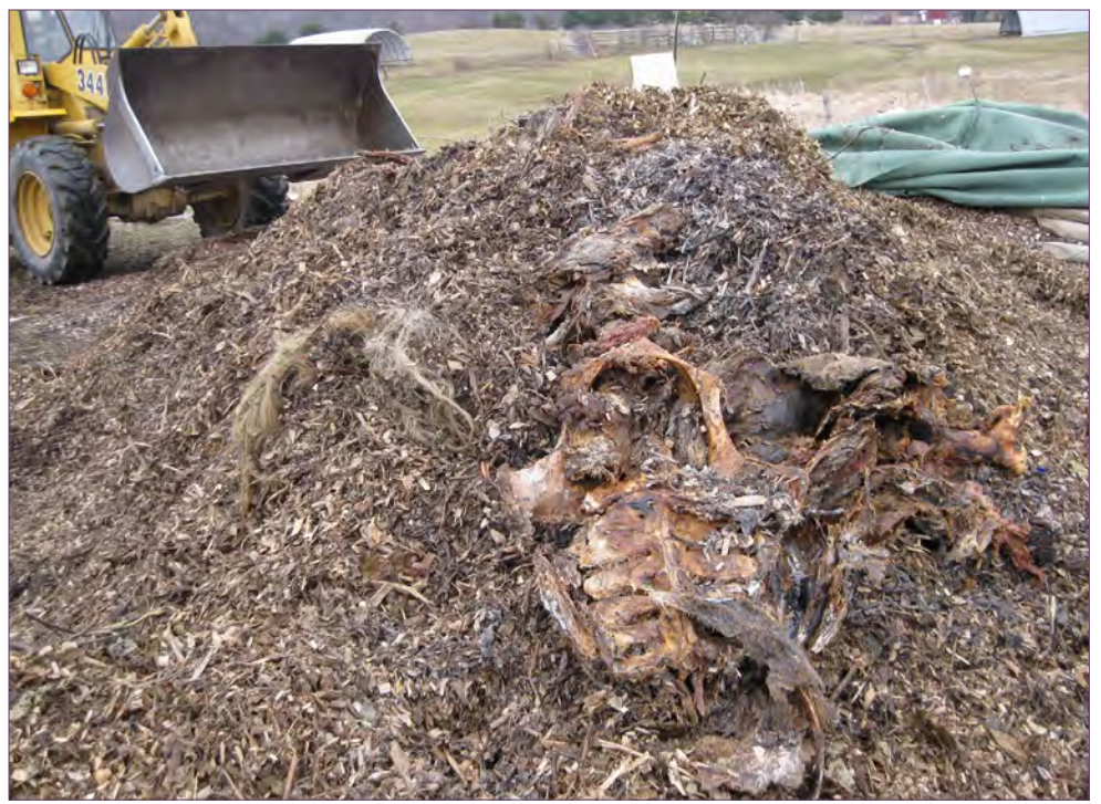
Figure 6-3. Compost pile opened after 4 months. Most of the soft tissue is gone, leaving some hide, hair and bones. The wood chips are dry on the outside having adsorbed and contained leachate and odors.

carcasses (e.g. birds and fish) and moderate carcasses (e.g. pigs, small deer and calves). However, a pile or bin cannot accommodate numerous layers of whole large carcasses, such as mature sows, cattle and horses. Larger animals are typically composted in a pile, windrow or bin with only one or two layers. As more animals are added, additional piles are started or the pile is expanded in length creating a windrow.