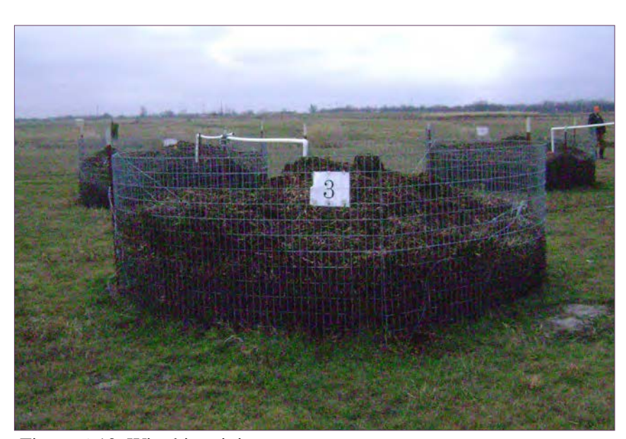
Figure 6-12. Wire bin mini-composter

Mini-composters represent a special application of passively aerated bins. They were developed for poultry but can be used for any small animals up to 30 lbs. (13.6 kg) including piglets, rabbits and fish. The beauty of mini-composters is that they can be located within the animal rearing areas and can be sized according to need.