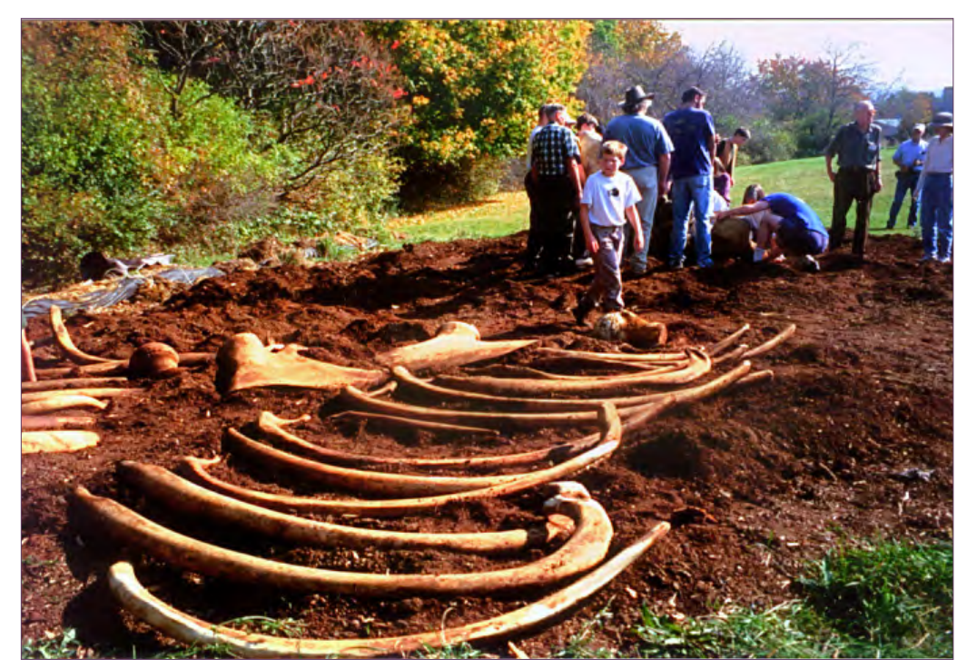
Figure 6-1. Whale bone remains following composting

and is biosecure. The temperatures achieved through the composting process may eliminate or greatly reduce pathogens, hindering the spread of disease. Research continues to demonstrate effective destruction of nearly all livestock diseases of concern. Properly composted material is environmentally safe and a useful soil amendment.