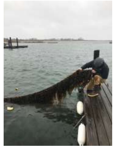
Adelphi University professor examining kelp growth as part of the Hempstead Bay research project.

For more information about the Nutrient Bioextraction Initiative, please visit https://on.ny.gov/NutrientBioextraction .