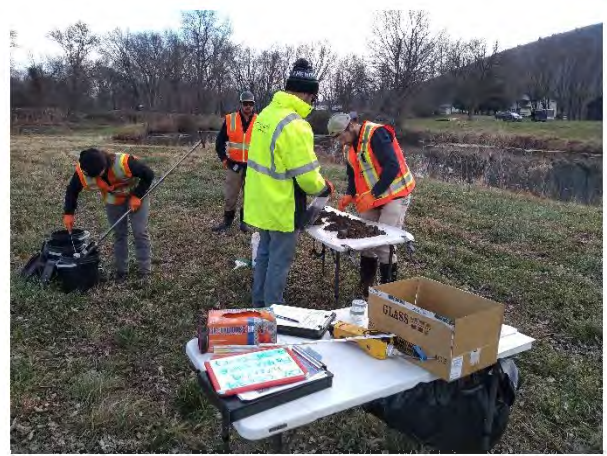
Overbank soil sampling along Coldbrook Creek

Unisys has identified the downstream extent of impacted sediments in Coldbrook Creek and is now investigating the extent of impacted soils along the creek banks and in the flood zone. This work will continue and additional sampling within Coldbrook Creek is scheduled for this summer to complete a study of impacts to fish and wildlife. Sampling results will be used to plan future remedial actions, as necessary.