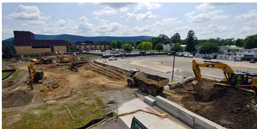
Cleanup activities on EHS property during summer 2019

In early June, Unisys will begin site preparations for Interim Remedial Measure No. 4 (IRM #4) to remove below-ground contaminated soil located next to the EHS building on the north and west side of the locker rooms (see Figure 1).