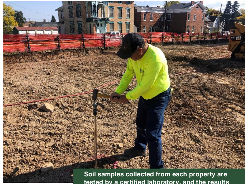
Soil samples collected from each property are tested by a certified laboratory, and the results are shared with the property's owners.

DEC and its consultants have completed soil sampling within the remedial boundary required to prepare property-specific excavation and restoration plans and have shared these results with property owners. DEC will continue to collect post-excavation samples and continue to test all imported fill materials as needed. Owners and residents in areas remaining to be remediated will be kept informed as areas are scheduled for cleanup. DEC is adaptively managing this project to ensure the remediation and restoration activities are completed as efficiently as practicable while continuing to ensure the protection of public health and the environment and minimize disruption to the community.