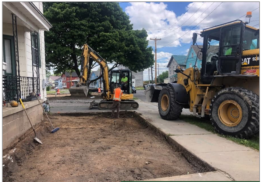
Excavation plans for each property are reviewed with property owners prior to construction.

https://www.dec.ny.gov/chemical/107812.html