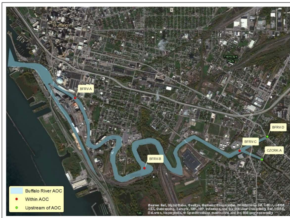
Figure 1: Buffalo River AOC and 2013-2015 Monitoring Locations

selected based on their proximity to potential sources of contamination, flow of the river, and their ability to allow for safe access and collection of samples. The two sites located upstream of the AOC were selected in order to represent the upstream boundary conditions of chemical contaminants. No sample locations were selected within the City Ship Canal because its isolated hydrologic connection to the Buffalo River does not adequately represent the overall environmental conditions of the AOC.