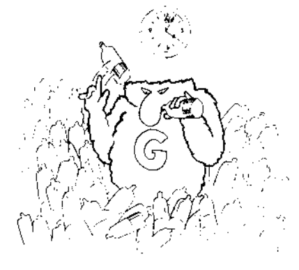
We throw away 2.5 million plastic bottles every hour (22 billion plastic bottles every year)!