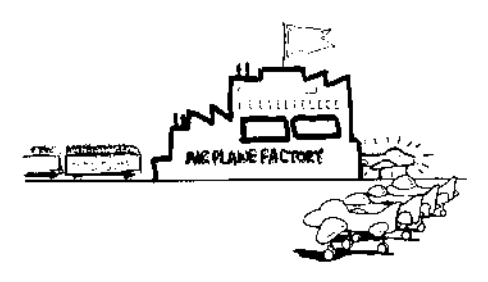
With the aluminum we throw away in 3 months, the United States could rebuild its entire commercial air