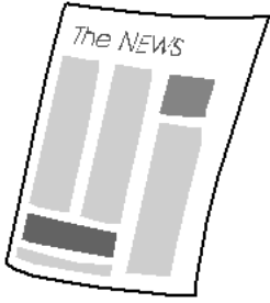
Newspaper 2-4 weeks