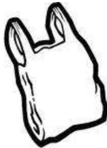
Plastic Bag over 500 years