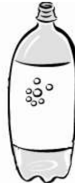
Plastic Bottle over 1000 years