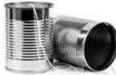
Tin Can 80-100 years