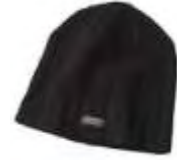
Wool Cap 1-5 years