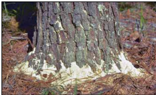
Figure 8. Boring dust of ambrosia beetles around the base of a tree vacated by southern pine beetles.

Generations overlap in the late spring and summer, and eventually an expanding infestation will contain trees with all beetle life stages. Small infestations usually have one area with trees under attack, called the spot head (Fig. 9). As infestations enlarge, additional spot heads may develop. The continual emergence of brood and parent adults, coupled with pheromone production of attacking beetles at the spot head(s), sustains infestation growth. Large infestations may spread at a rate of >120 ft/day, and satellite infestations may develop nearby.