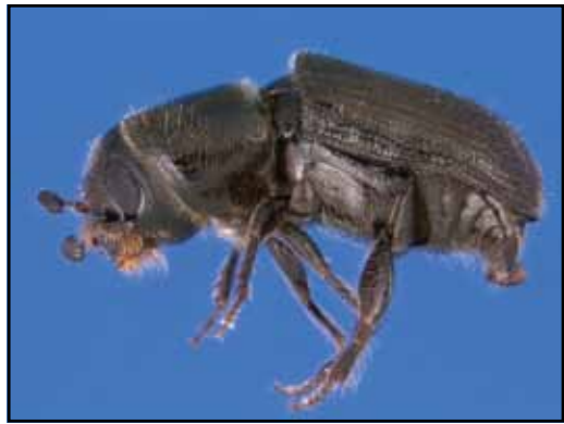
Figure 2. Adult southern pine beetle.

The female initiates the attack. Once a suitable host is located, the female releases aggregation pheromones, primarily frontalin. Frontalin, in combination with host odors, attracts a male for mating plus additional males and females. Arriving males also release pheromones, including endo -brevicomin, which may increase aggregation. If sufficient numbers of beetles are attracted, host resistance is overcome and the tree is successfully colonized. Verbenone is a pheromone produced essentially by males, and at high concentrations it can inhibit landing and cause beetles to switch attacks to adjacent pines.