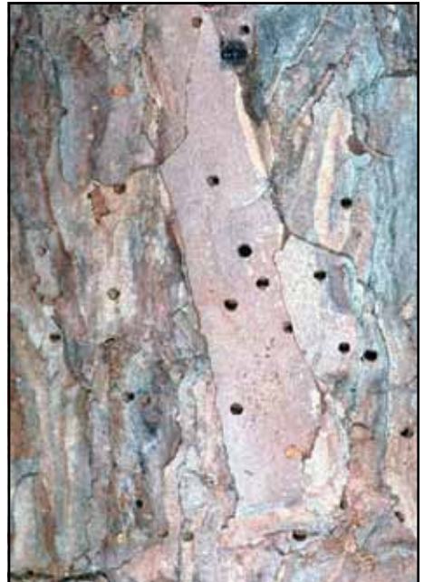
Figure 6. Southern pine beetle brood adult exit holes.