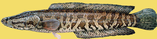
Northern Snakehead

The regulations, adopted on July 28, 2014 and published in the State Register on September 10, 2014, take effect March 10, 2015. Grace periods exist for Eurasian boar ( Sus scrofa ) until September 1, 2015 and for Japanese barberry ( Berberis thunbergii ) until March 9, 2016.