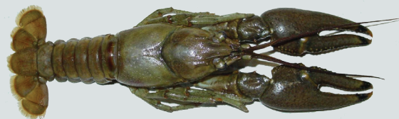
Rusty Crayfish