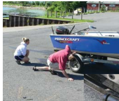
Check all possible attachment points on your boat and trailer for clinging plants and debris.