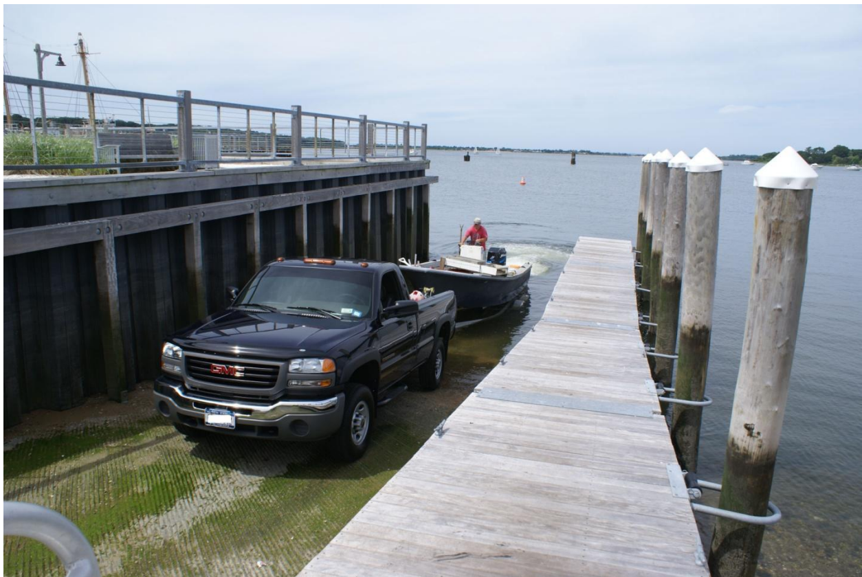
NYSDEC Oyster Bay Western Waterfront Boat Ramp

A listing of facilities for the launching of trailer boats into the marine waters in the Town of Babylon