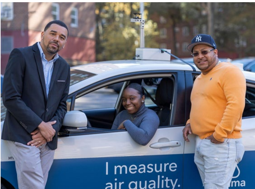
Mobile air monitoring will be conducted using Aclima hybrid vehicles. Drivers will be trained through a partnership between Aclima and BlocPower.

To measure air pollution from sources such as cars, diesel trucks, construction equipment, commercial operations, and industrial facilities, cars equipped with sensors will drive throughout the neighborhood. The information collected will be used to create maps that show air pollutant estimates for every 100 meters (about 330 feet of road) across the community. This information will help identify air quality issues and help guide actions to reduce localized pollutant levels and target sources of greenhouse gases. The pollutants that will be measured include carbon dioxide, carbon monoxide, nitric oxide, nitrogen dioxide, ozone, fine particulate matter, methane, ethane, black carbon, and targeted toxics. The map below is an example of pollutant measurements for fine particulate matter (called PM 2.5 ) in a similar study conducted in California. These maps and data will be made available to local organizations in the 10 communities.