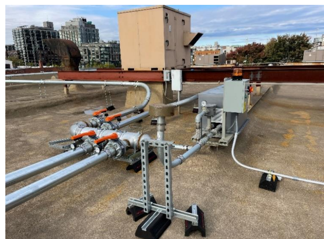
Example of a commercial SVI installation on a Brooklyn rooftop

These systems are tailored to individual building conditions. After installation, additional sampling is conducted to verify the system is effective at preventing contamination from affecting indoor air quality.