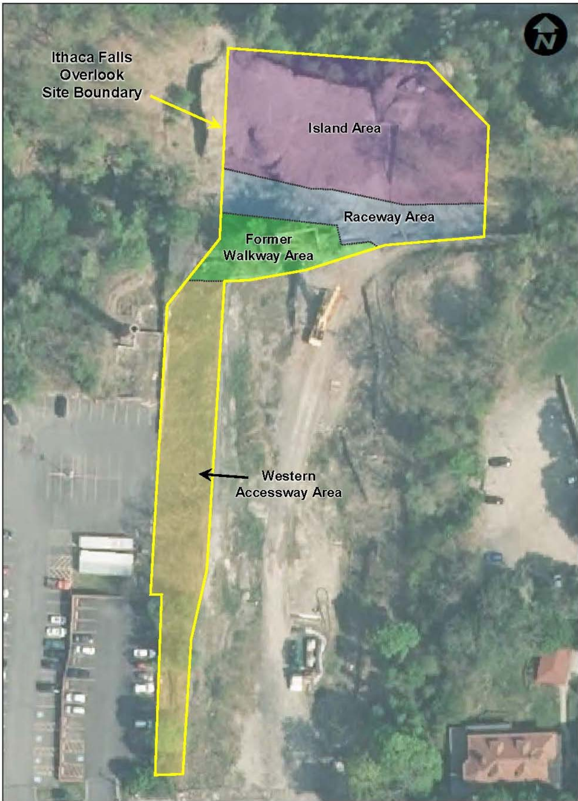
FIGURE 2 – SITE AREAS Ithaca Falls Overlook, E755018 City of Ithaca, Tompkins County