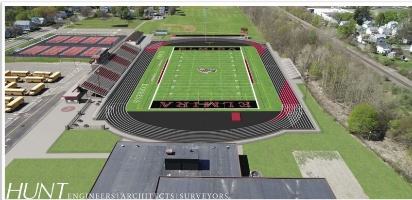
Image 1: Architectural Rendering - Elmira High School Athletic Complex

The purpose of this newsletter is to update the community regarding unexpected cleanup activities completed by Unisys to ensure a thorough and effective remedy and resulting in an extension of the date for completion of the Stadium Restoration by Elmira City School District (ECSD). Stadium Restoration including a new turf field, track, and grandstands is now anticipated to be complete by Summer 2022.