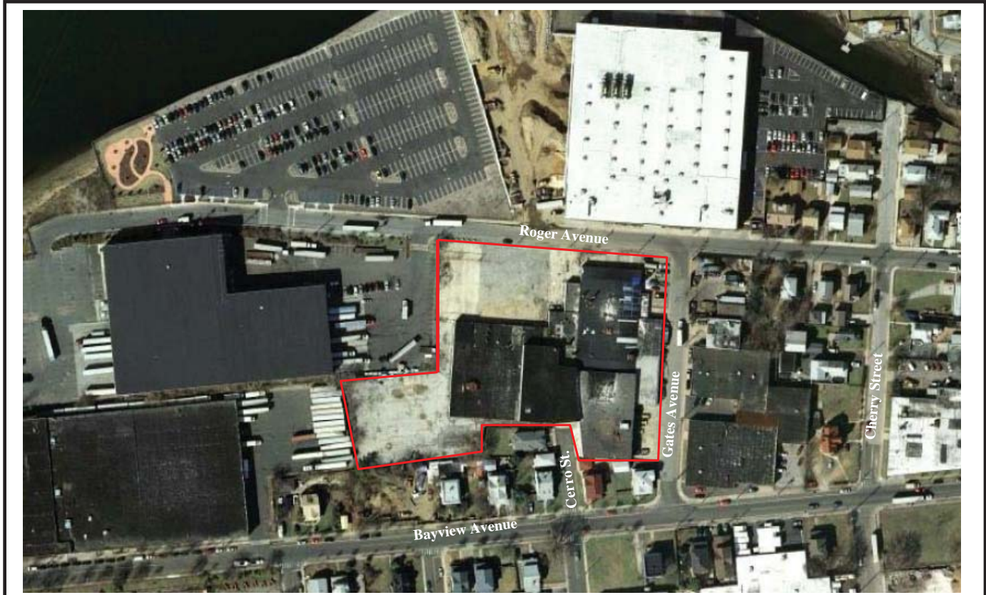
FIGURE 1 - SITE LOCATION