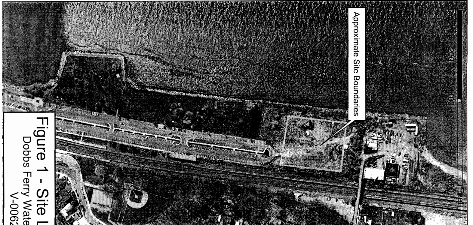
Figure 1 - Site Location Map Dobbs Ferry Waterfront Park Site V-00628-3