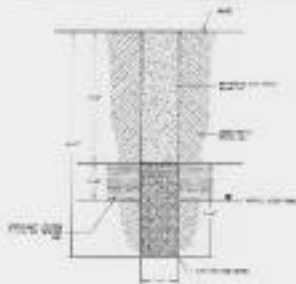
① RECOVERY TRENCH 10' DEEP

NOTE: 1. EXPOSED TO AIR 2. EXPOSED TO AIR 3. EXPOSED TO AIR