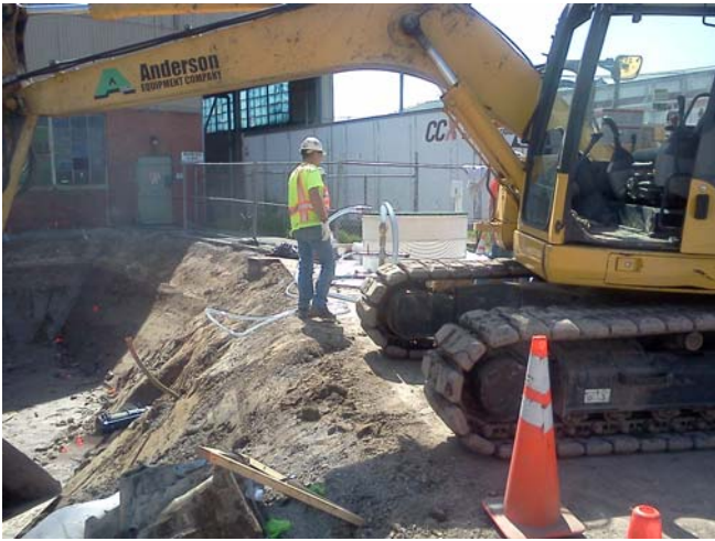
052511-05 Augmentation Tank.jpg