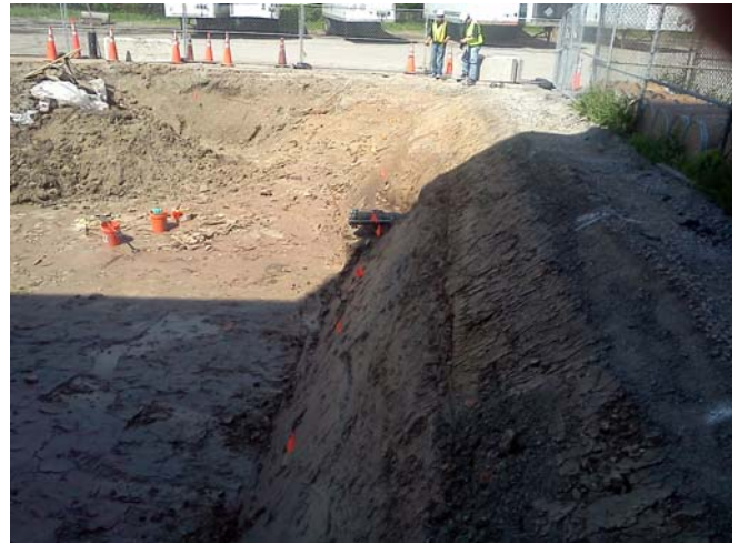
2511-02 PID Locations North Wall.