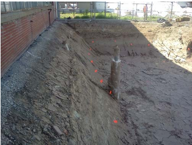
2511-03 PID Locations East Wall.j