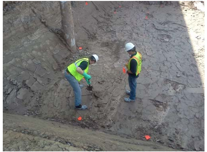
52511-06 Floor Sample CON-03.jp