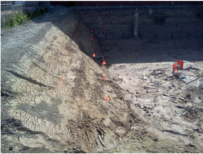
2511-01 ID Locations North wall.jpg