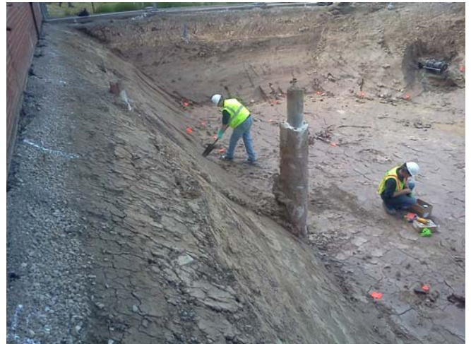
52511-08 Wall Sample CON-06.jp