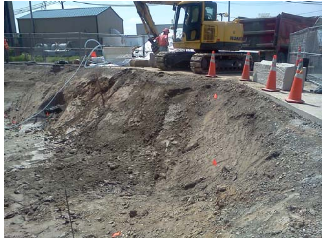
I-10 Excavation Complete SW Cor