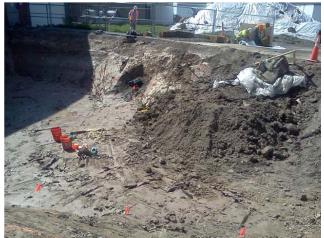
052511-04 SW Corner .jpg