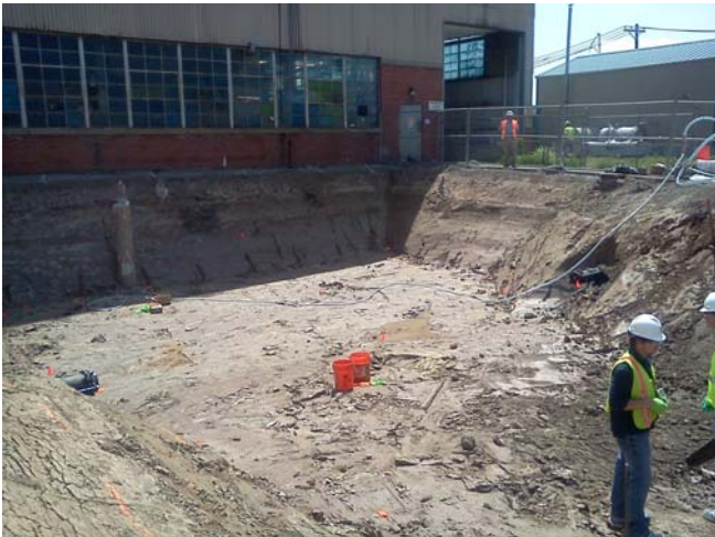
52511-11 Complete Excavation.jpg