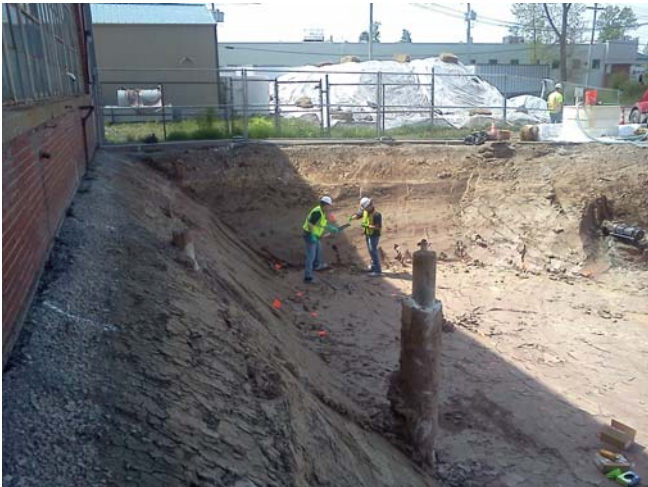
52511-07 Wall sample CON-05.jp