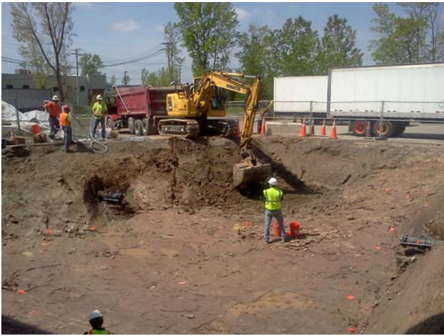
511-09 Soil Excavation SW corner