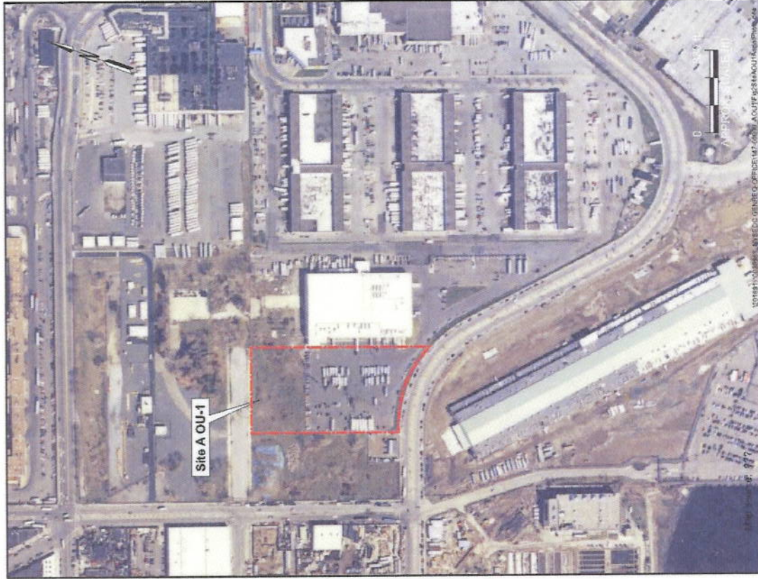
HDR | LMS HARRINGTON, DUBOIS & SULLIVAN ARCHITECTS AND ENGINEERS, P.C. IN ASSOCIATION WITH HDR ENGINEERING, INC. ONE BIRCHWOOD DRIVE WEST FARM, NY 10988 Site A OU-1 Aerial Photograph Hunts Point • Site A First Operable Unit Figure 2