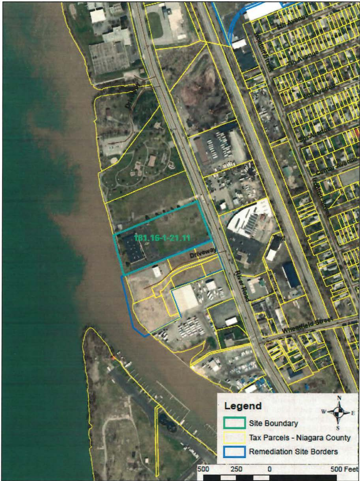
EXHIBIT A SITE MAP