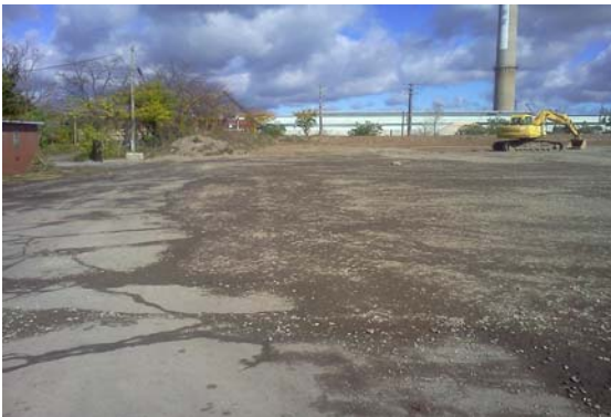
After remediation: west side entrance of site