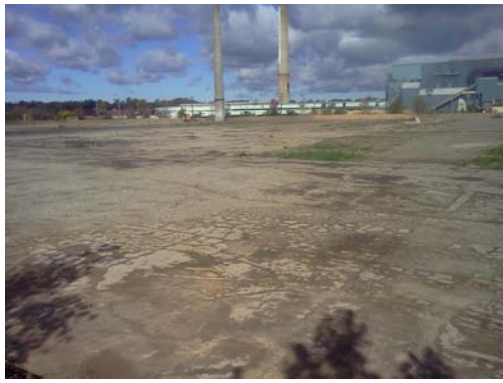
After remediation: south east corner of site