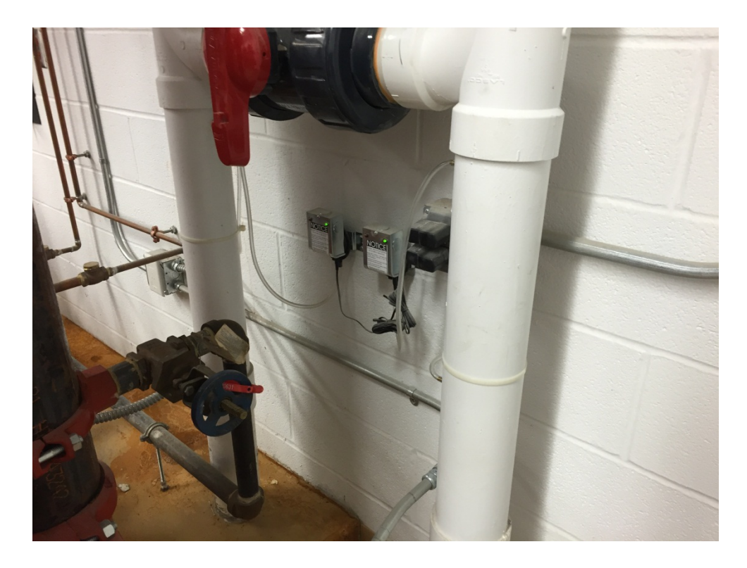
Photograph No. 5 – Sub-slab Depressurization System in basement, depicting alarms and stack discharge piping.