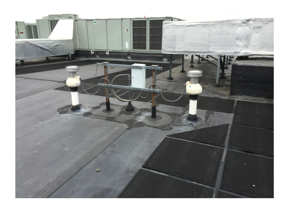
Photograph No. 6 – Sub-slab Depressurization System discharge vents and blowers and power control for discharge vents.