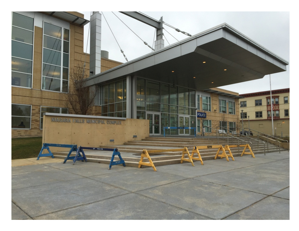
Photograph No. 1 – Exterior of Niagara Falls Municipal Complex Building, west side.