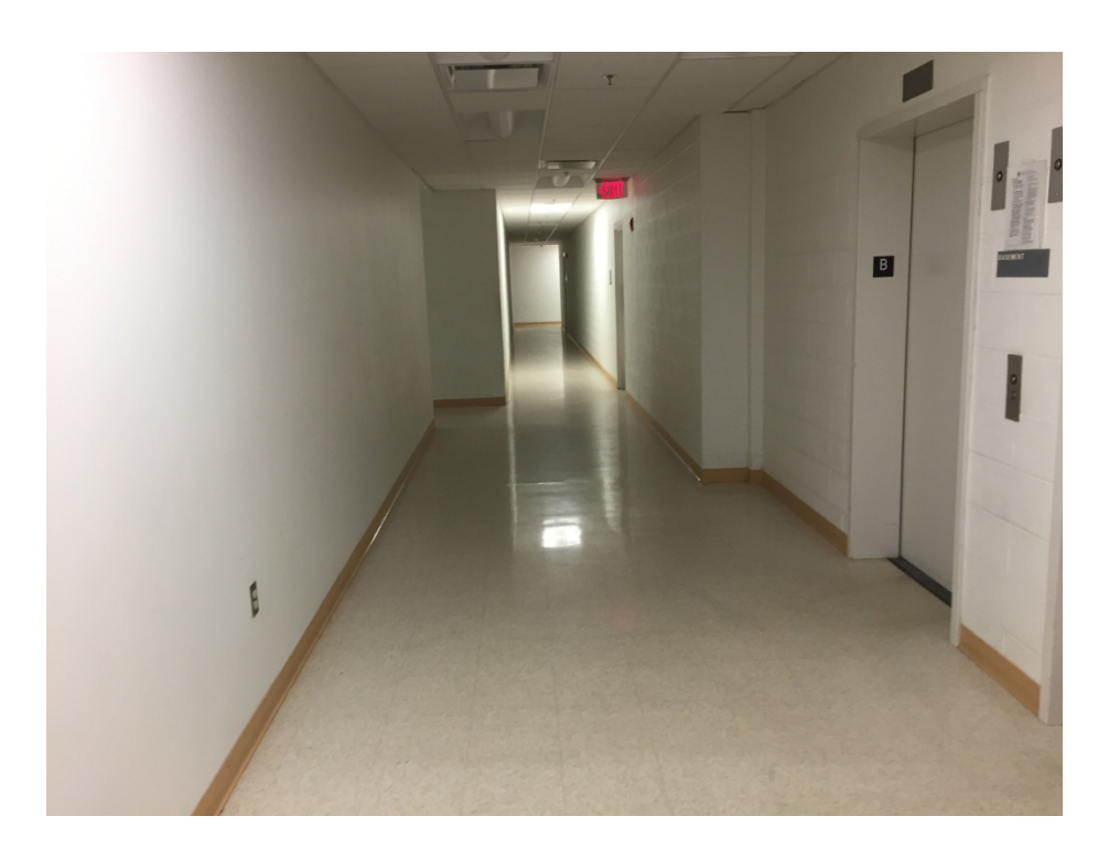
Photograph No. 3 – Basement level of Niagara Falls Municipal Complex Building depicting general conditions.