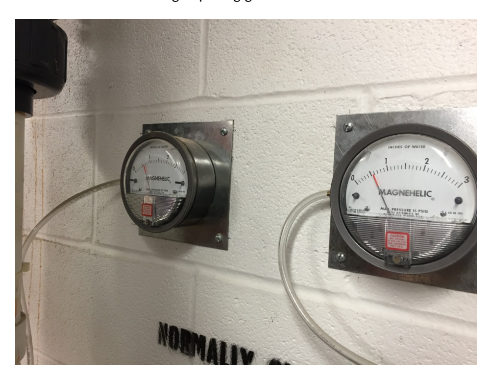
Photograph No. 4 – Sub-slab Depressurization System in basement, depicting pressure gauges.