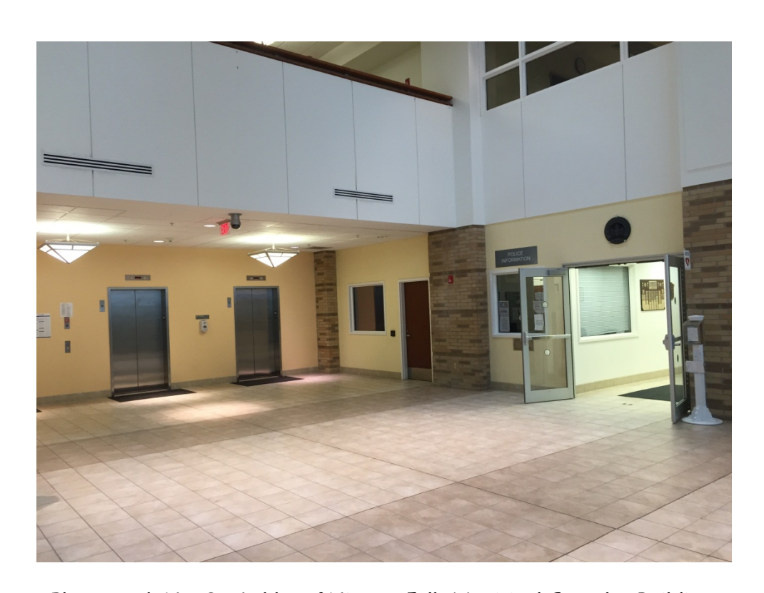
Photograph No. 2 – Lobby of Niagara Falls Municipal Complex Building.