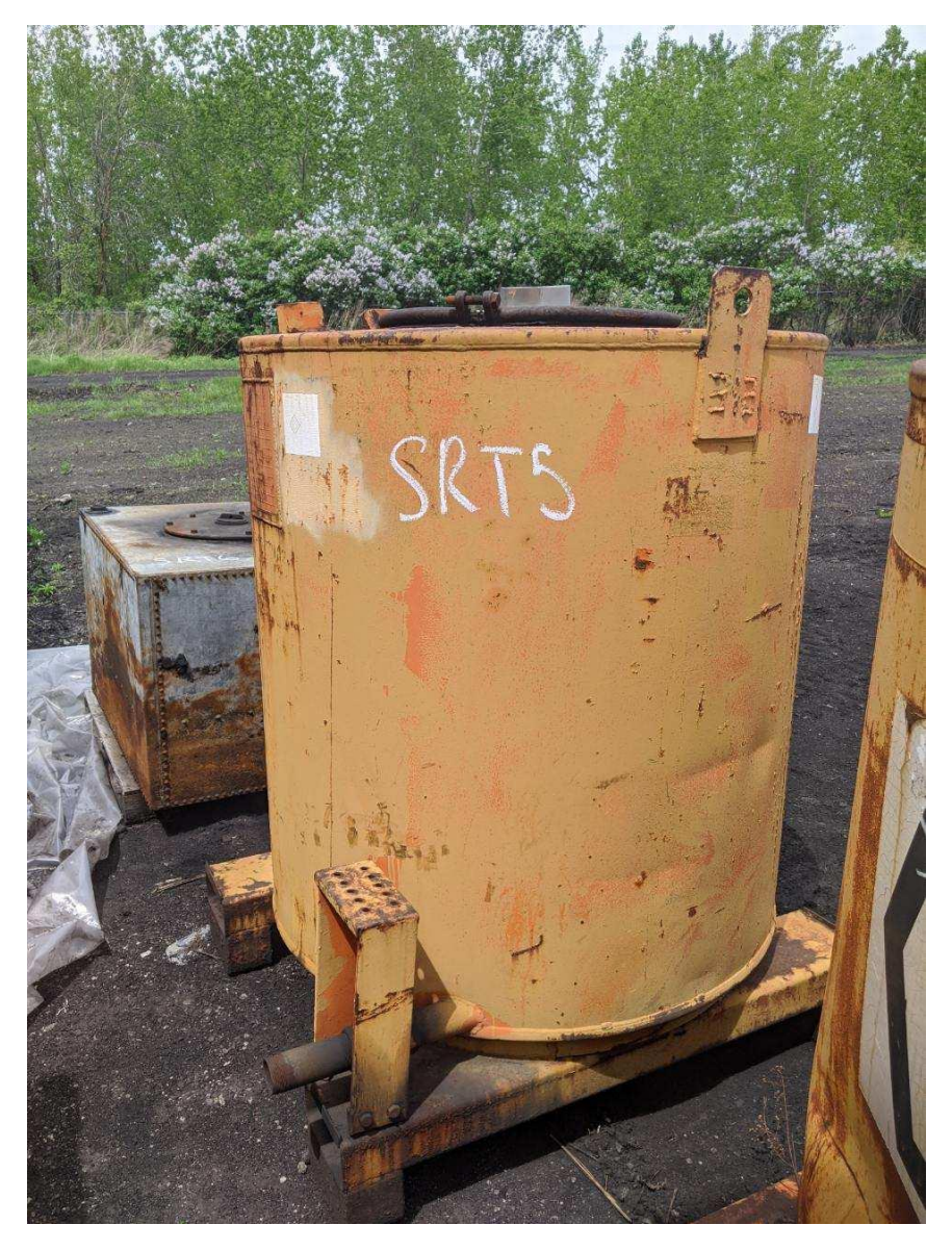
Photograph C-13 300 Gallon Tote SRT – 5 (Similar to SRT -4)