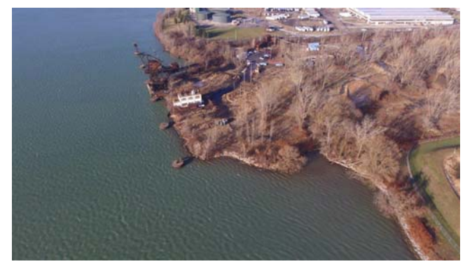
OU3, also referred to as Site 108, (shown above) is an operable unit nearest the Niagara River where an abandoned tank farm was located.

Outside of the boundaries of the main facility comprising the BCP footprint are three operable units that will be fully remediated by Honeywell International. In February 2020, <u>DEC executed</u> <u>a consent order</u> with Honeywell International, the corporate successor to a prior facility owner, to investigate and remediate each operable unit in a manner that is fully protective of public health and the environment.