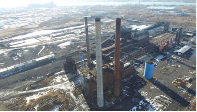
Coke ovens, by-products, storage tanks, stacks and other above-grade infrastructure remain on site today, but will be demolished during the Brownfield Cleanup Program.

The Riverview Innovation & Technology Campus (RITC) site encompasses about 86 acres of the 102-acre former Tonawanda Coke Corporation (TCC) facility at 3875 River Road, Town of Tonawanda. The site was used for more than a century as a coke manufacturing and byproducts recovery facility – most recently by TCC between the late 1970s and 2018.