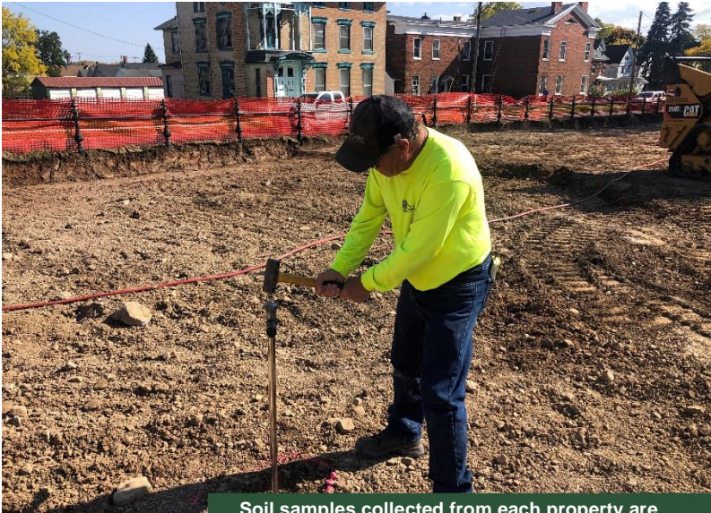
Soil samples collected from each property are tested by a certified laboratory, and the results are shared with the property's owners.

DEC and its consultants have completed soil sampling within the remedial boundary required to prepare property-specific excavation and restoration plans and have shared these results with property owners. DEC