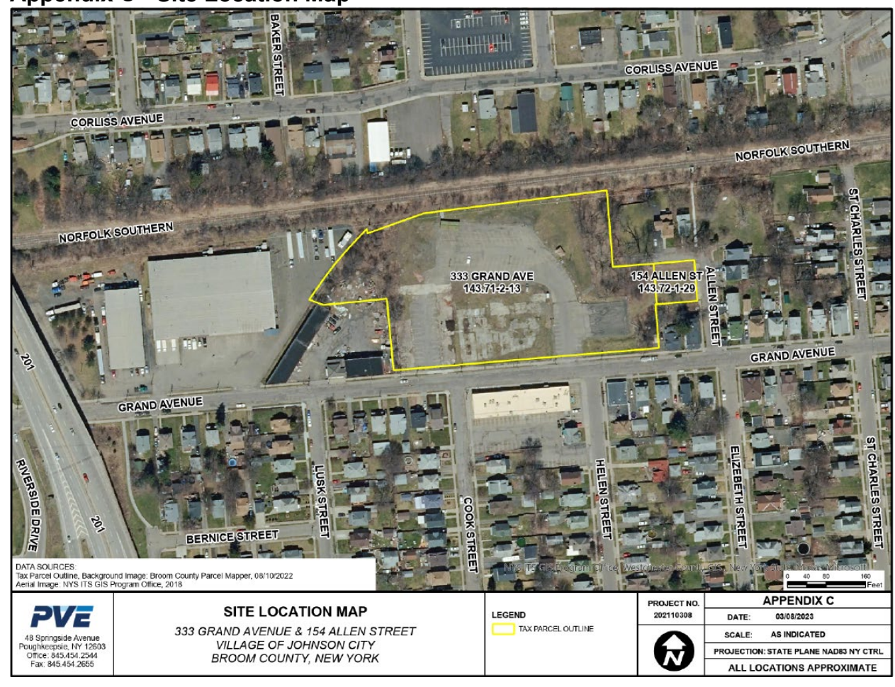
Appendix C - Site Location Map