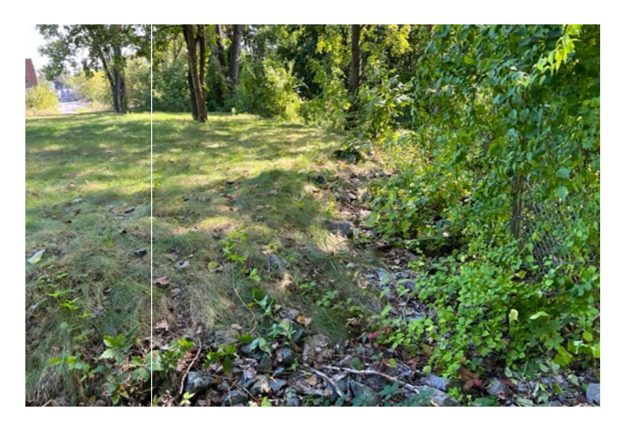
Post Silt Fence Removal Conditions