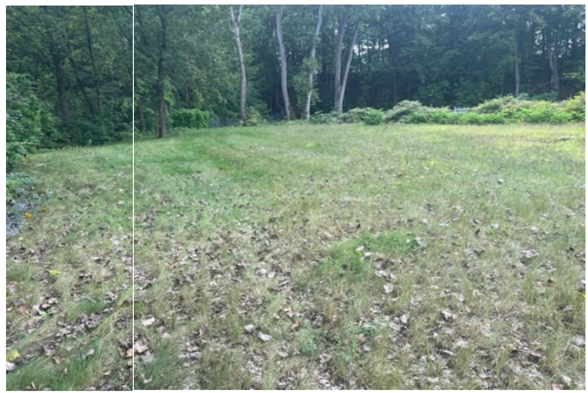
Soil Cover System

NYS Department of Environmental Conservation Office of Environmental Quality, Region 5 Division of Environmental Remediation Attn.: Kelly Duval, P.E. September 15, 2023 Page 3