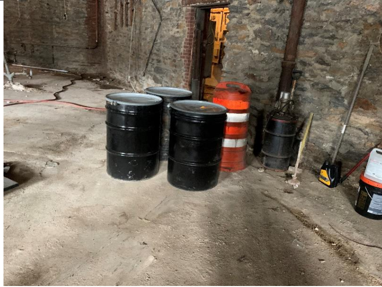
Photo 3 – View of hydraulic oil containing drums (2), and spent absorbent material (1) awaiting disposal.