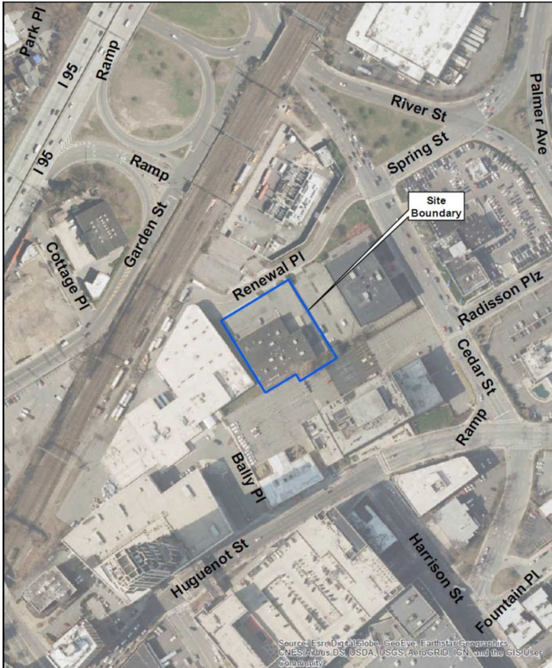
Site Location Map