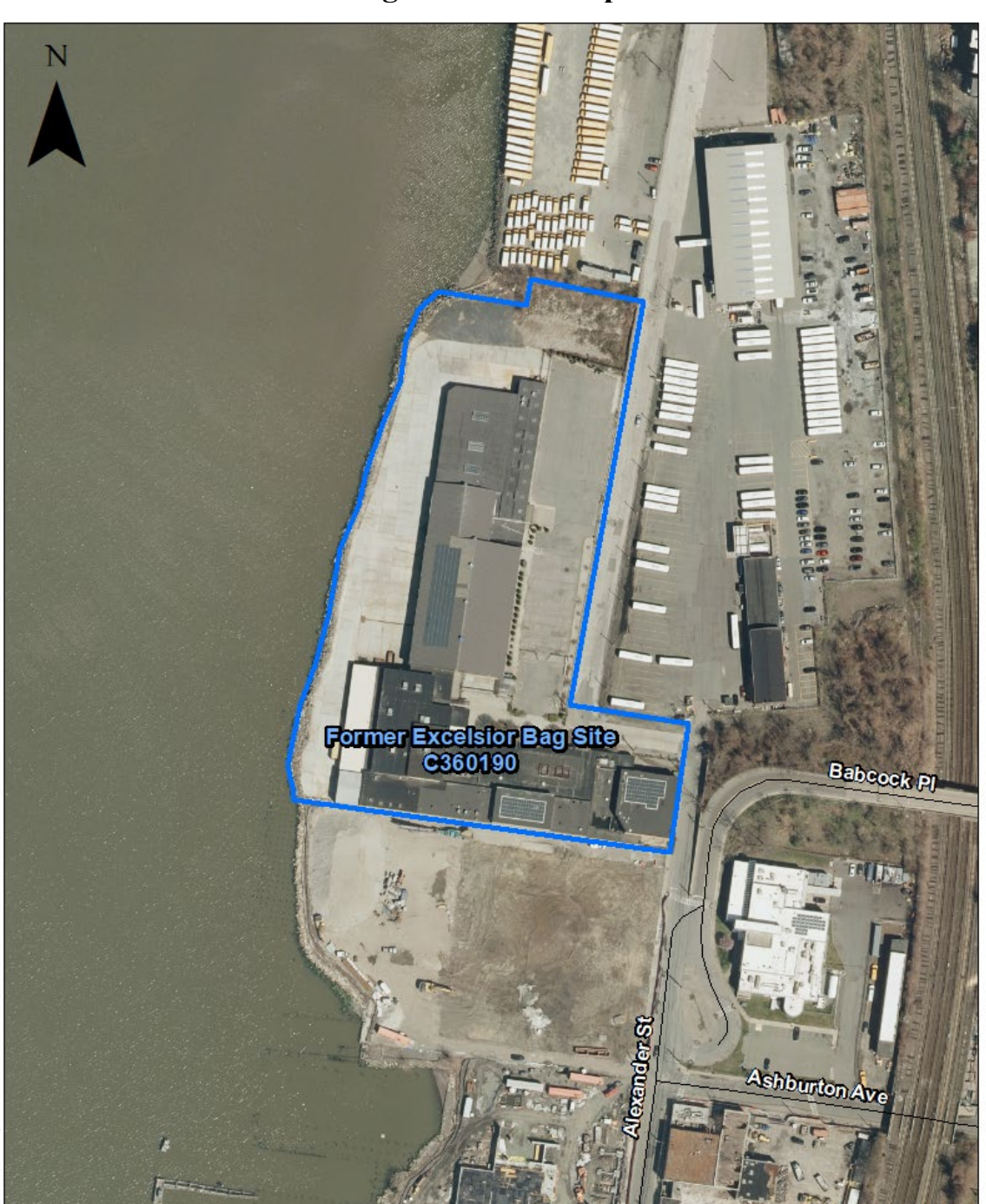
Figure 2 - Site Map