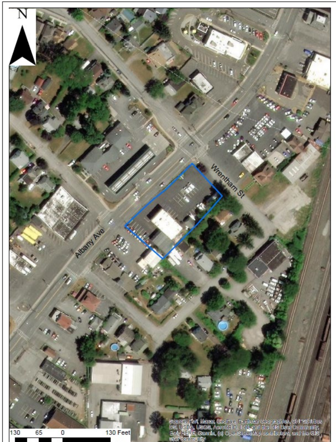
Albany & Wrentham LLC (C356057)