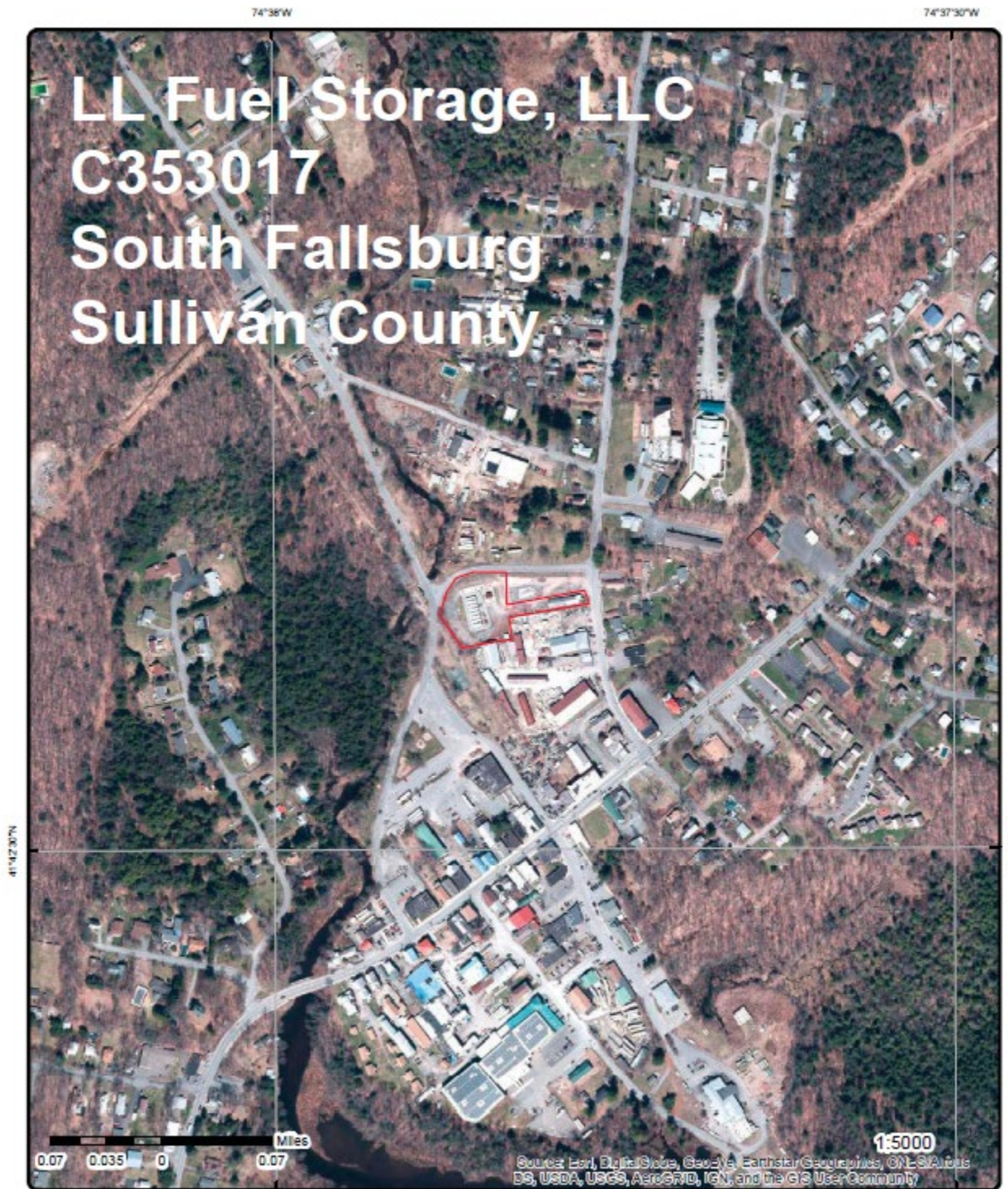
EXHIBIT A SITE MAP