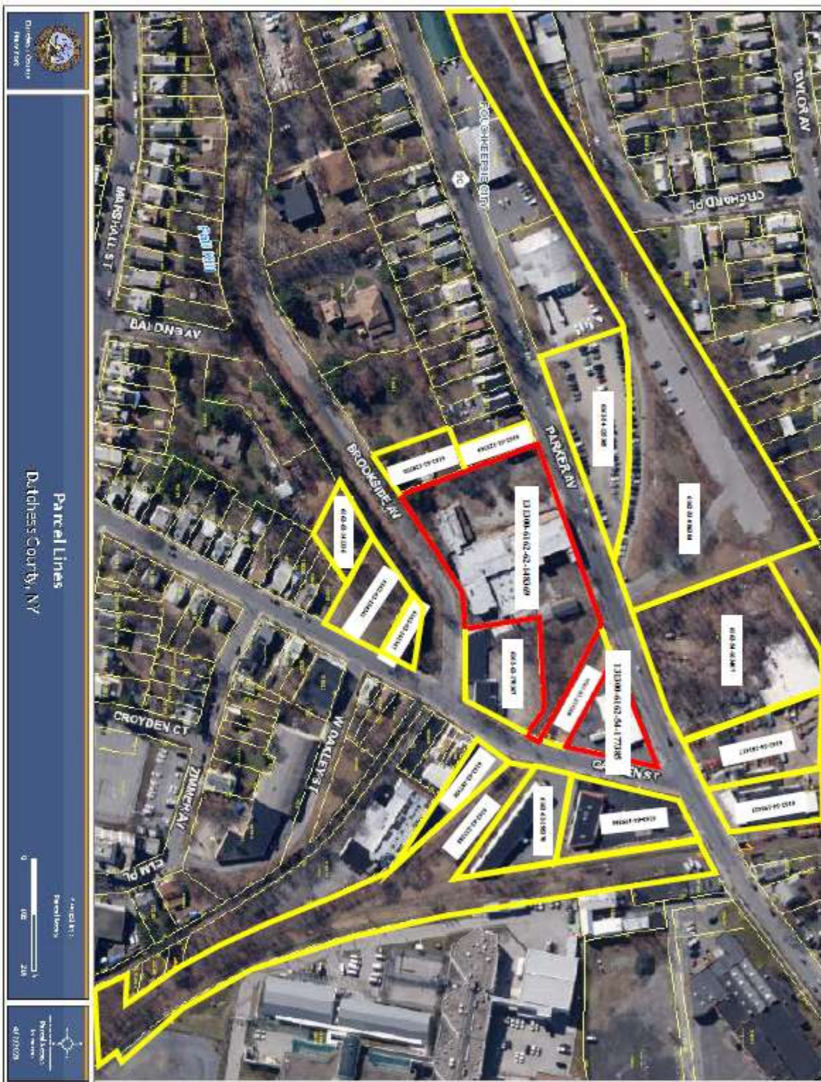
EXHIBIT A SITE MAP