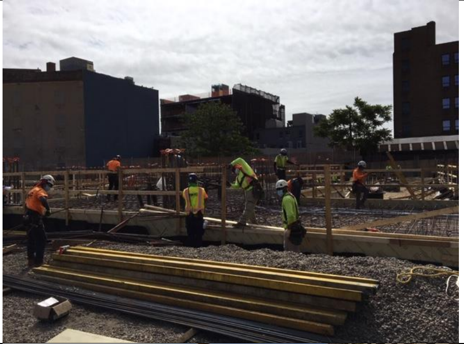
Photo 2- View of backfilling with gravel in C5 and D5.