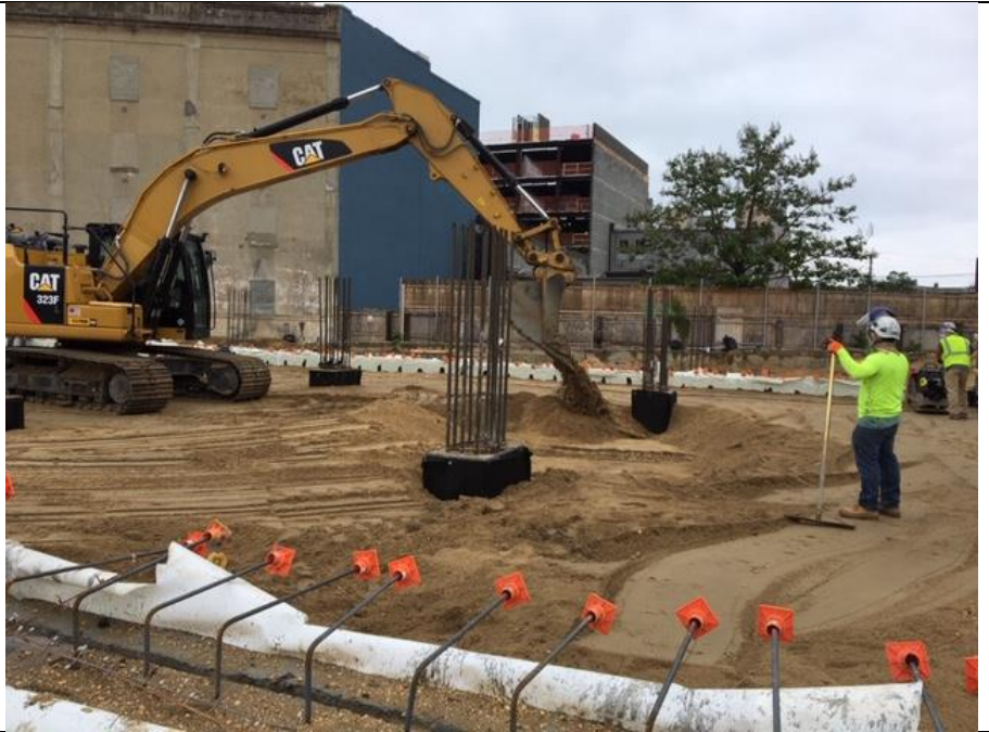
Photo 2- View of pouring concrete in D5 and D6.

Photo 1- View of backfilling with clean fill in grid C7, C8, D7, and D8.