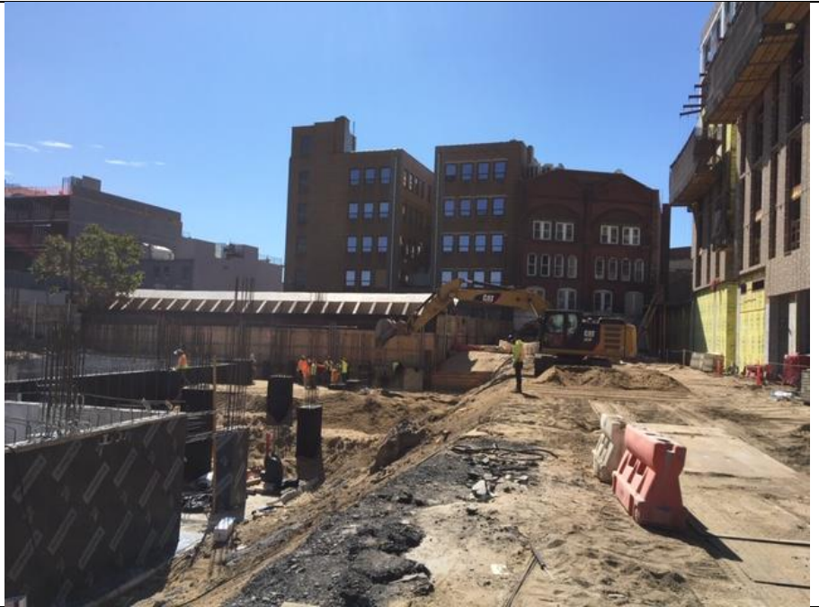
Photo 2- View of formwork and rebar installation in C7 and C8.

Photo 1- View of backfilling with clean fill in grid D5 and D5.