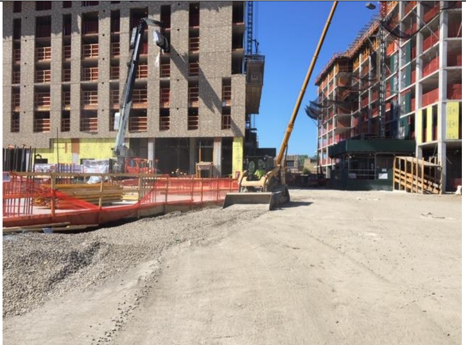
Photo 2- View of formwork, rebar, and utilities installation in D3, D4, E3, and E4.