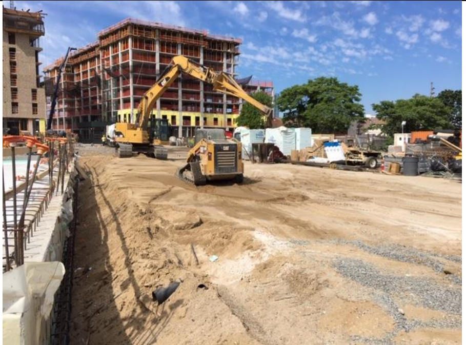
Photo 2- View of pouring concrete in A3, A4, B3, and B4.