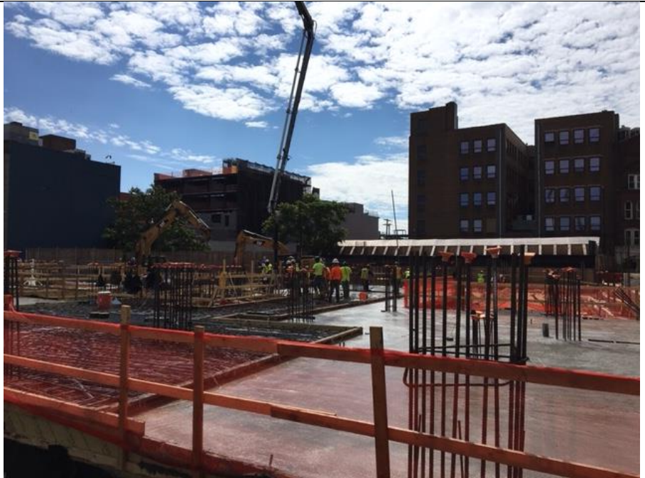
Photo 2- View of formwork, rebar, and utilities installation in D3, D4, E3, and E4.