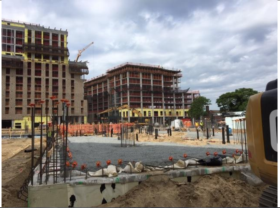
Photo 2- View of formwork, rebar, and utilities installation in D3, D4, E3, and E4.