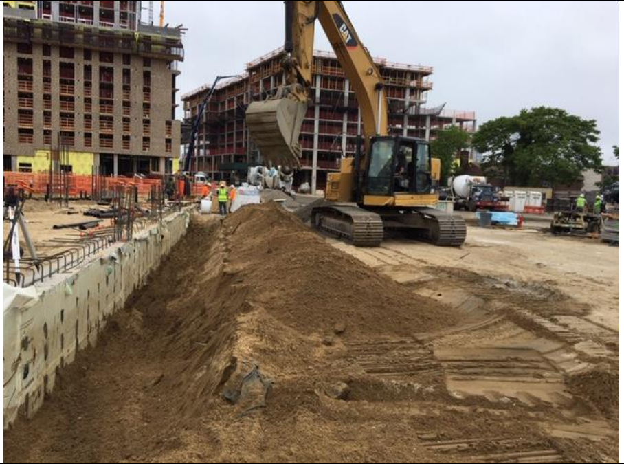
Photo 2- View of formwork, rebar, and utilities installation in D3, D4, E3, and E4.