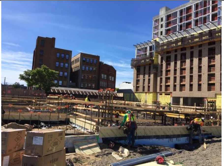
Photo 2- View of backfilling with gravel in C5 and D5.