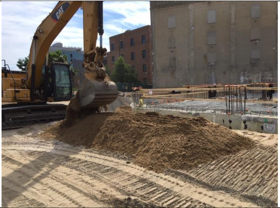
Photo 2- View of formwork, rebar, and utilities installation in A3, A4, B3, and B4.