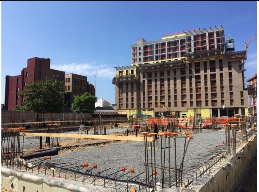
Photo 2- View of formwork, rebar, and utilities installation in D3, D4, E3, and E4.