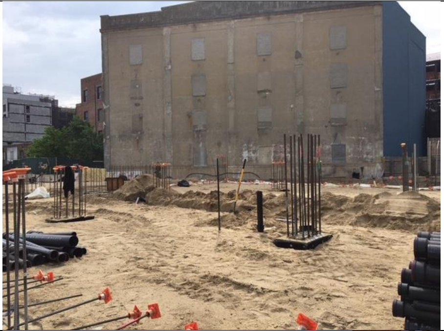
Photo 2- View of backfilling in C5, C6, and D5.