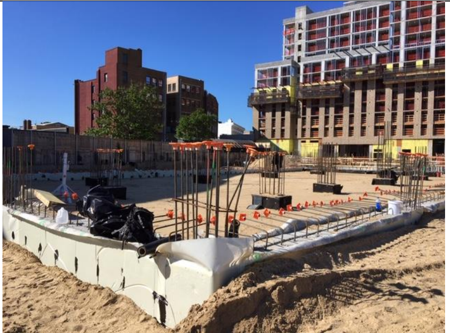
Photo 2- View of utility work and spreading stone in C5, C6, and D5.