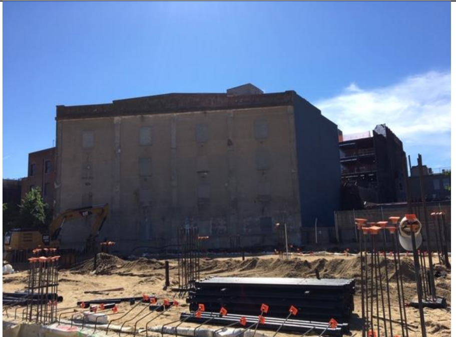
Photo 2- View of utility installation in C6 and C7.