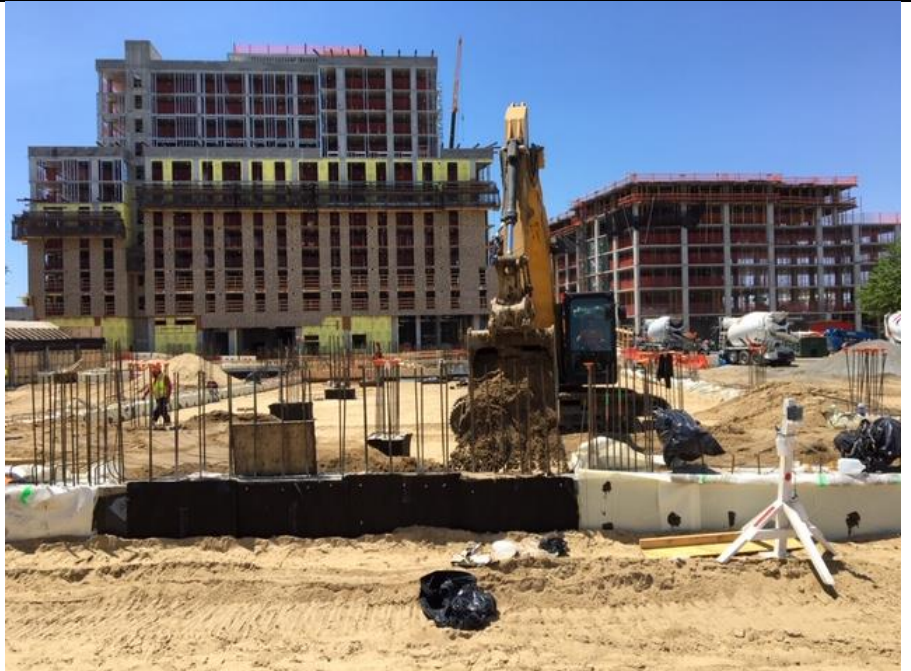
Photo 2- View of utility work and Preprufe 200 installation in C5, C6, and D5.