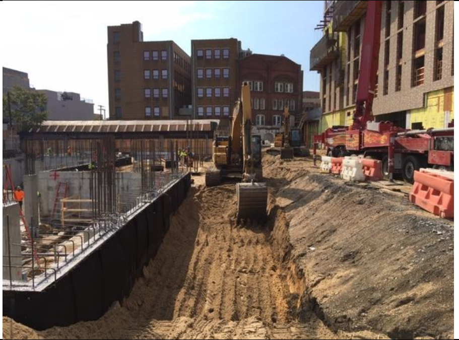
Photo 2- View of formwork and rebar installation in C7 and C8.