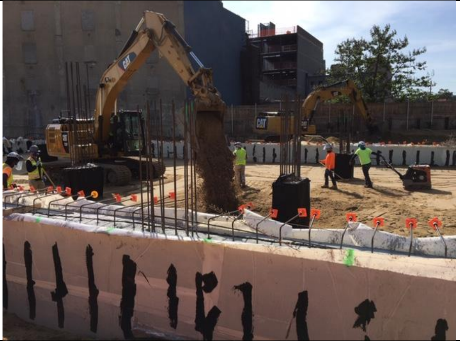
Photo 2- View of Preprufe 200 installation in C5 and D5.