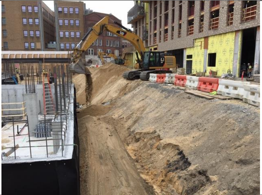
Photo 2- View of pouring concrete in C7 and C8.