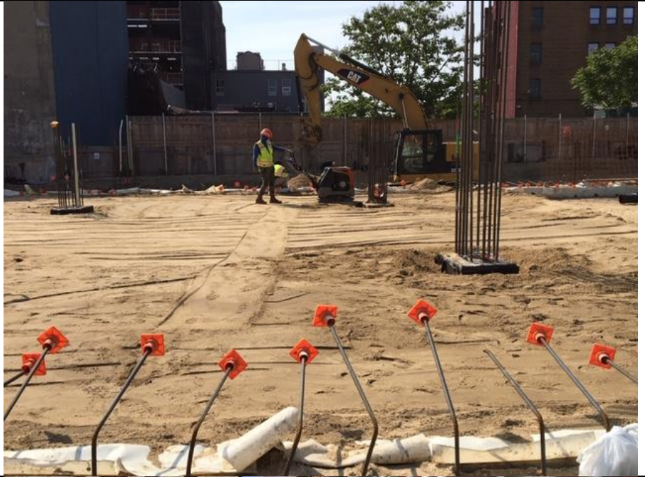
Photo 2- View of pouring concrete in C5, C6, and D5.

Photo 1- View of backfilling area with clean fill in C7, C8, D7, and D8.