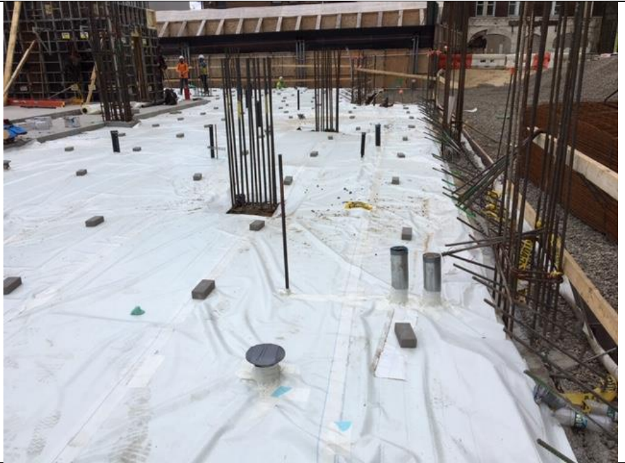
Photo 2- View of pouring concrete in D5 and D6.