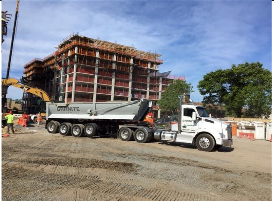
Photo 2- View of backfilling with gravel in C5 and D5.