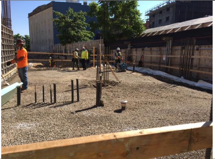
Photo 2- View of installing formwork, rebar, and waterproofing installation in C5 and D5.