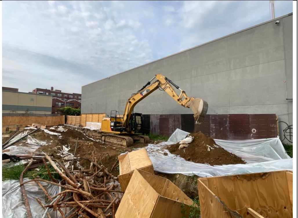
Photo 4 – The hazardous Stockpile in A1 at the end of the workday.