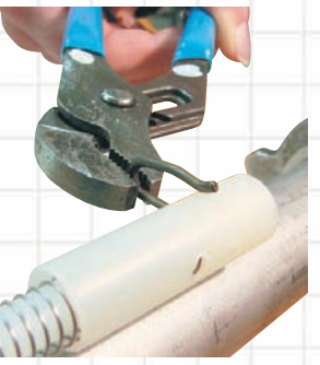
Removing the spring clip allows for easy disassembly of the float.