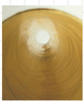
Smooth ID helps reduce the rate of solid buildup inside the casing.