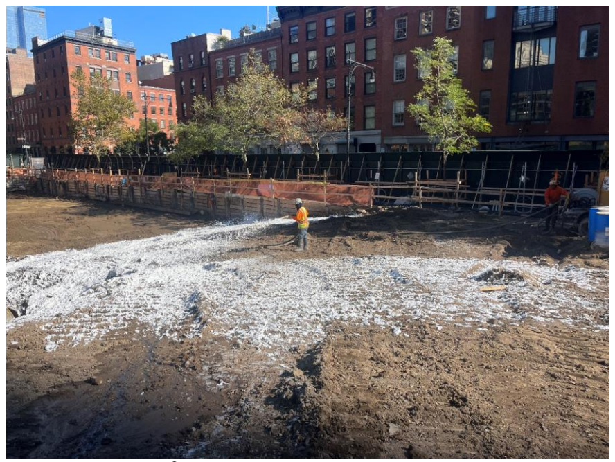
Photo 2: CCJV applying Atmos® AC-645 dust/vapor suppressing foam to exposed soil/fill for the temporary overnight cover (facing southwest)