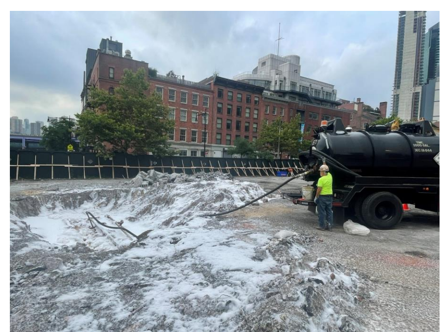
Photo 1: Brookside removing petroleum product/water mixture from a previously identified UST in the eastern part of the site (facing southwest)