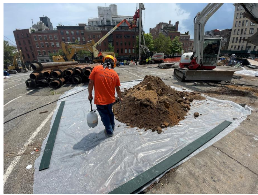
Photo 2: CCJV applying Mercon-X® to excavated soil/fill from the northern perimeter of the site (facing south)

Photo 1: Brookside removing petroleum product/water mixture from a previously identified UST in the eastern part of the site (facing southwest)