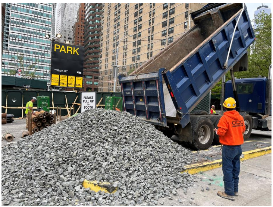
Photo 1: CCJV importing one truckload of 2.5-inch virgin stone for installation of a tracking pad in the northwestern portion of the site (facing northwest)