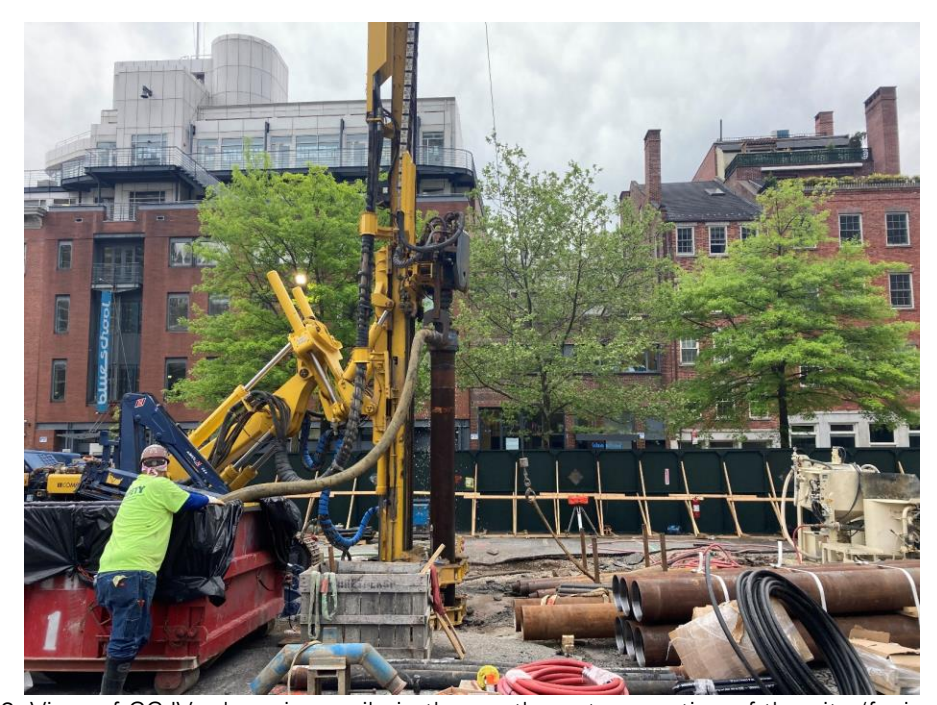
Photo 2: View of CCJV advancing a pile in the southwestern portion of the site (facing south)