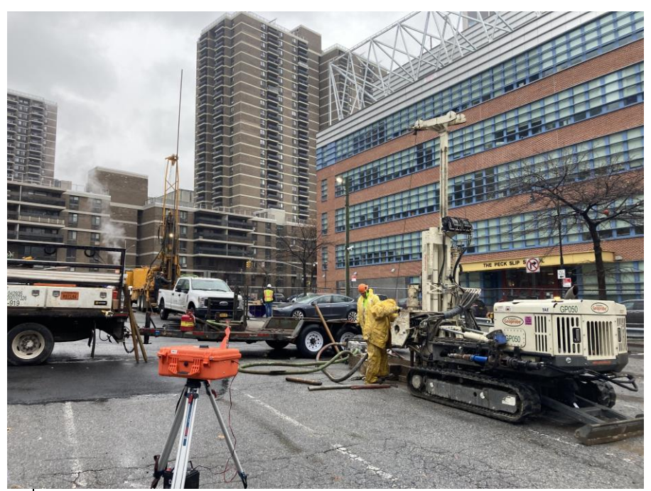
Photo 1: View of AARCO drilling at LB-6 and LB-11 (facing northeast).