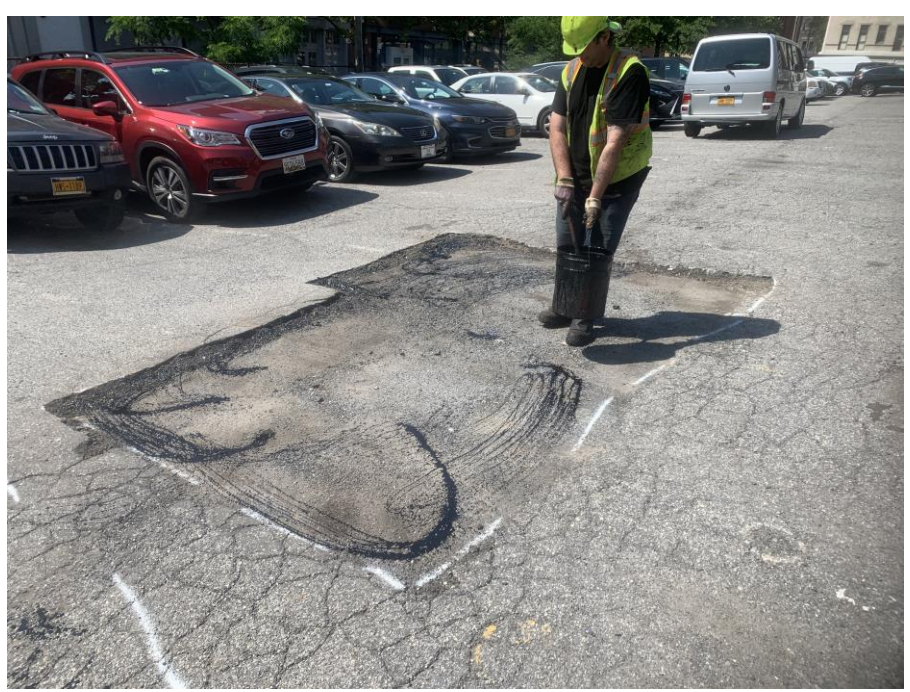
Photo 1: View of cut edges in the existing asphalt and placement of AC-5 (facing project southwest)