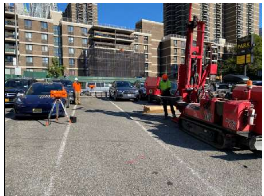
Photo 2: CAMP station WZ-1 and perimeter CAMP station PM-4 along Pearl Street during the drilling of boring SB36 (facing northwest)