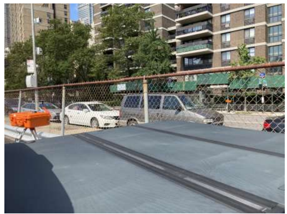
Photo 2: Perimeter CAMP station PM-4 and off-site CAMP station WZ-1 along Pearl Street during the drilling of boring SB29 (facing west).